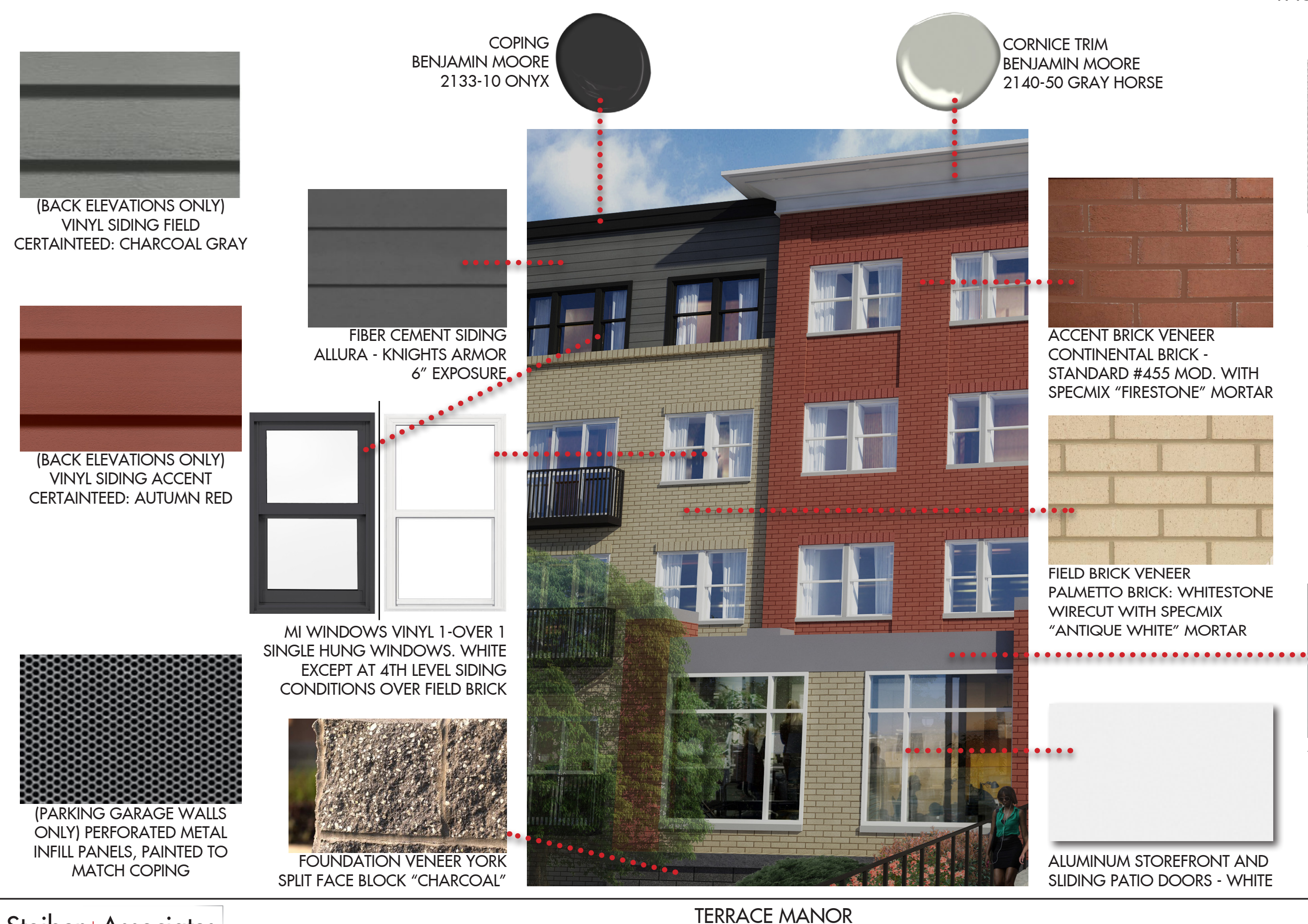
Stoiber+Associates Architecture Interiors